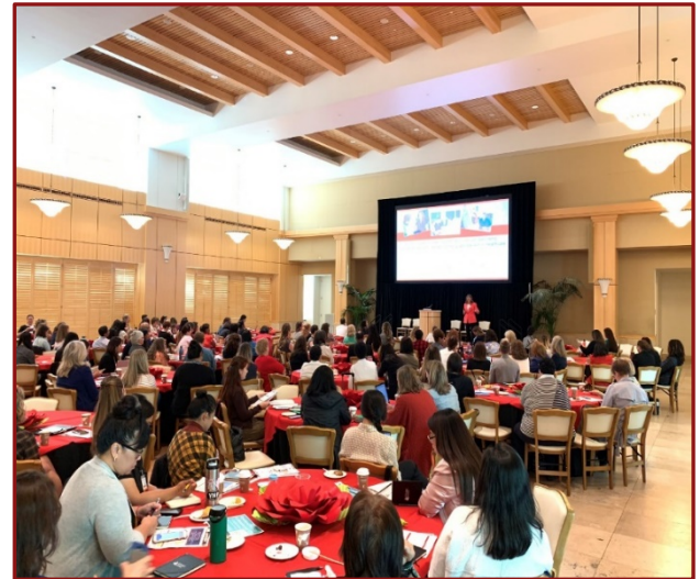
Pictured: Keynote Session Healthcare Con 2019